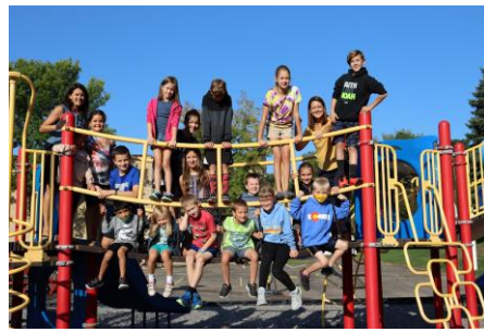
Kom Family Group