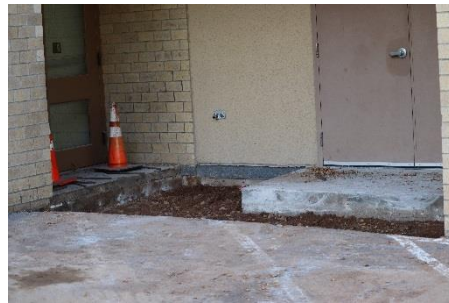
The recess doors all footed and ready for cement