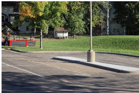
No more stones in the island