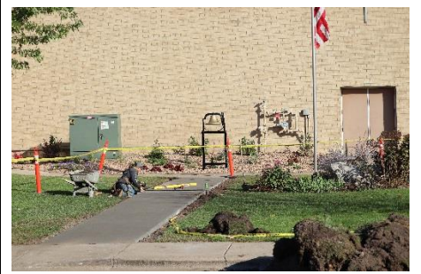
A middle sidewalk that connects the front with the school walkway