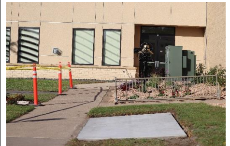
A permanent cement area for our bike rack