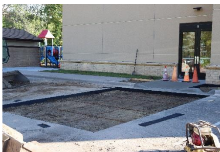
No more peninsula & new even entryway